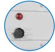
LED indicator light & push-button test switch